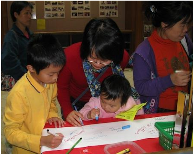
A family signs the "longest" birthday card at the celebrations for Burnaby Public Library's Bob Prittie Metrotown Branch's 20th Anniversary.

enthusiasm of the searchers - both parents and children!