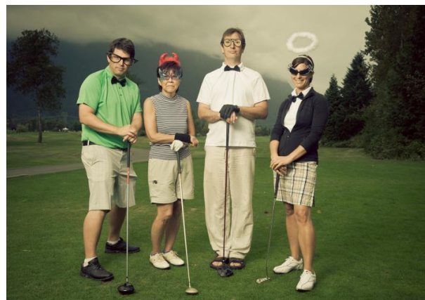
at the Port Moody Public Library's "Links to Literacy" golf tournament.

As the association moves forward into 2012 and beyond, engaging and involving this membership will become even more important to ensuring BCLA's vitality, stability and longevity. I can say, from experience, that there is more than enough work to occupy a full-time Executive Director. Maintaining this position at part-time and still managing to