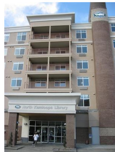
North Kamloops Library.

The Thompson-Nicola Regional District has received a Union of British Columbia Municipalities award for its North Kamloops Library Square Project. This is the second year in a row the TNRD has won the 2011 UBCM Community Excellence Award for Leadership & Innovation - Regional District. The award was handed out in September at the UBCM conference in Vancouver.