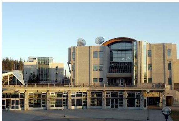
UNBC Campus, Prince George.