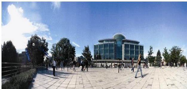
Strolling by UBC's Koerner Library.