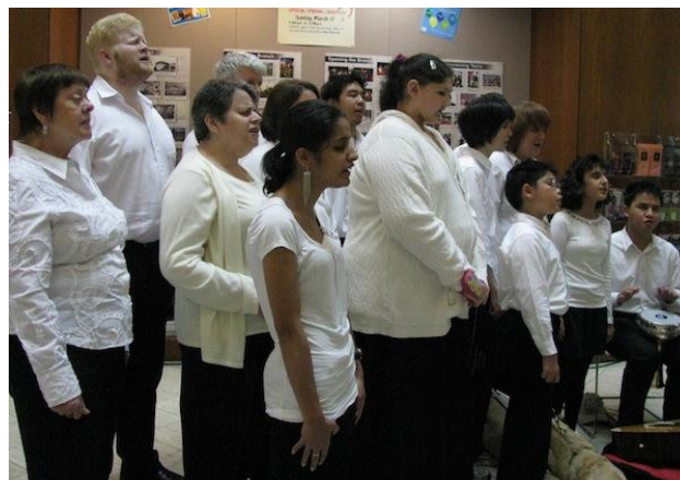
The Tempos Youth Choir sings in the foyer of the Bob Prittie Metrotown Branch of Burnaby Public Library.