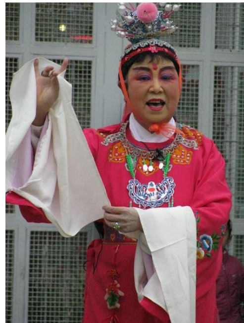
A singer performs Chinese opera aria in the Civic Square outside of Burnaby Public Library's Bob Prittie Metrotown Branch.

The day began with a community breakfast of free muffins and coffee at 7 a.m. The branch usually opens at 9 a.m. on a Saturday but it was busy by 7:30 a.m., with people lined up for the refreshments and asking for tickets to the puppet shows later in the morning.